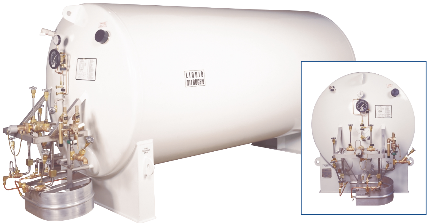
Chart Storage Systems Division, the leader in cryogenic bulk tanks, is pleased to present the new Horizontal Series Bulk Stations for liquid Nitrogen, Oxygen or Argon service. These HS Bulk Stations are engineered and built with the same quality you have come to expect, and have standard features along with pre-engineered options sure to satisfy all of your requirements. Chart's HS Series Bulk Stations are designed to ASME code and available in 175 and 250 psig (12 and 17 bar) as standards, with other pressures available upon request.

Advanced insulation technology provides longer holding times and the continuing development of insulation systems has resulted in unsurpassed performance. Our XCEL composite insulation is a lightweight system offering superior performance, and is easier to maintain offering longer product hold times.